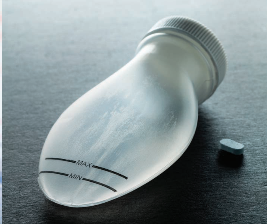
CIGHT's proprietary sputum cup gives patients goal lines to help them produce more viable samples.