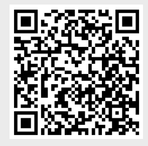
"How You Can Prepare"